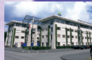
Wageningen, the Netherlands