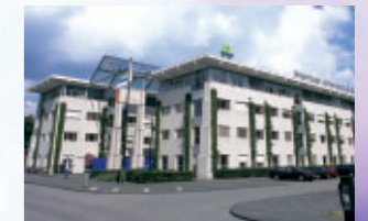
Wageningen, the Netherlands